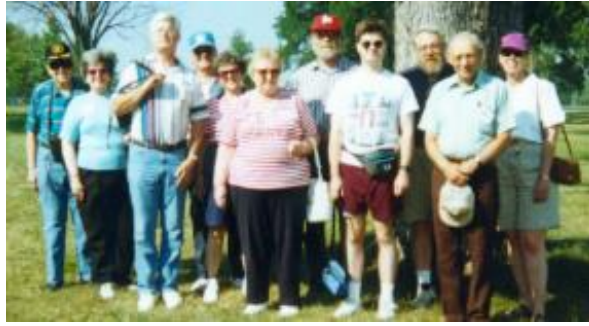
Some of the group at a stop