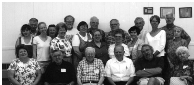
Saturday Banquet Attendees