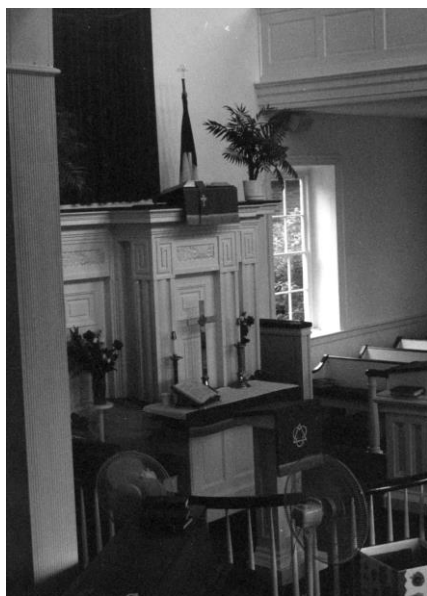
Brush Creek Church Interior